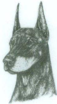
Ideal Dog Head